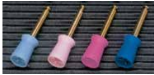
*AVAILABLE BY GROSS OR CLINIC BAG OF 1000

*To order Clinic Bags, add "-1000" at end of Product No. (Example: 402-A-1000*)